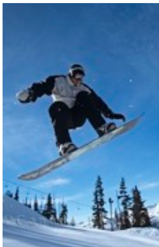
You ... tearin' up the slopes.

Please return this completed form along with a check for the desired registration amount ($200 or $150) made out to "Christ Community Church."