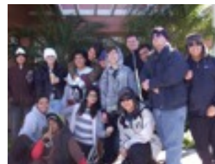
You ... having a great time with your friends.