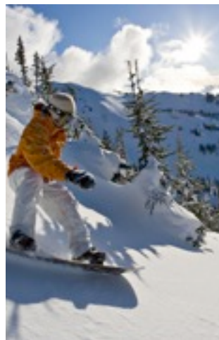
You ... letting your light shine.