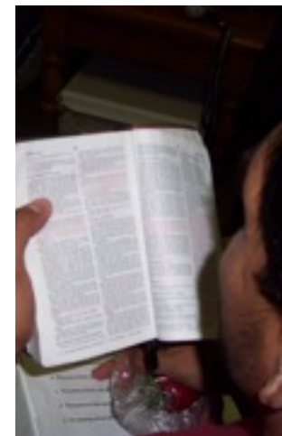
You ... intently studying the Bible.

"The Christian is the man who sees God: God in nature, God in history, God in grace. Everywhere he sees God in His mighty stepping, everywhere he feels the working of His mighty arm, the throbbing of His mighty heart. The Christian is the man who sees God behind all phenomena and in all that occurs recognizes the hand of God, working out His will. The Christian makes the attitude of the soul to God in prayer its permanent attitude in all its life activities; [he] casts himself on the grace of God alone, excluding every trace of dependence on self from the whole work of his salvation."